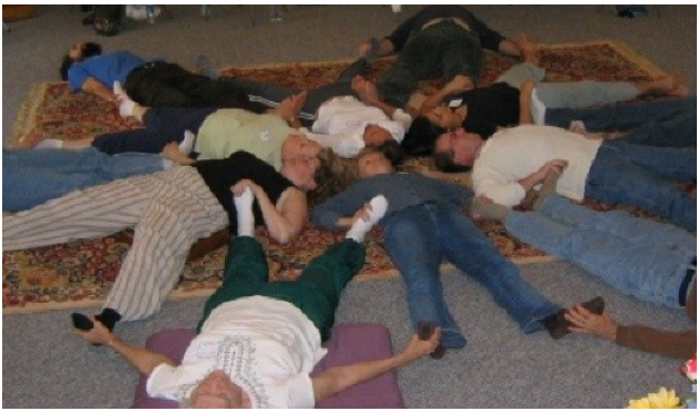
Sun Star Bloomington IN

Quantum-Touch is a remarkably effective & easily learned method of generating powerful healing that works with the Life Force Energy of the body to promote optimal Learn to Accelerate the Healing Process; Relieve Pain; Reduce Inflammation and Reduce Stress.